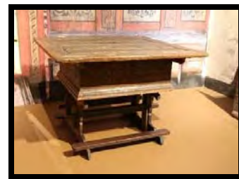
Luther's Writing desk