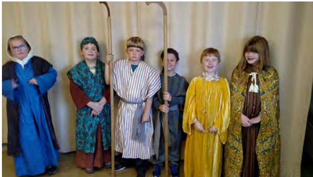
Trying on their costumes for the Christmas program

During the November 20th worship service, the kids gave thanks in song.