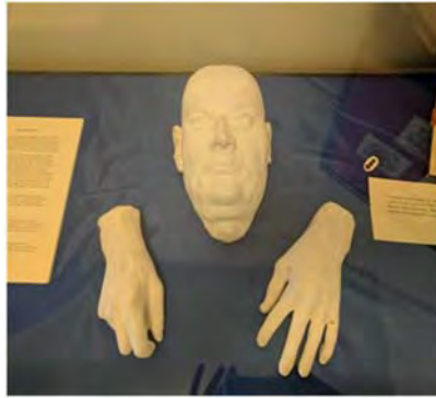
Luther's death mask, and hand casts. Displayed at Luther Seminary.

It was very interesting to see a piece of history, and to see the things we so often talk about when we talk about Luther, and so many things that we don't talk about, but were a part of the Luther daily life – dishes and a desk set, ledger and drafts of writings, an indulgence, and the coffer into which the forgiveness payment went. For an obscure monk in a small corner of the world to have made such a difference, is a testament to the power of the Spirit to make the ordinary extraordinary.